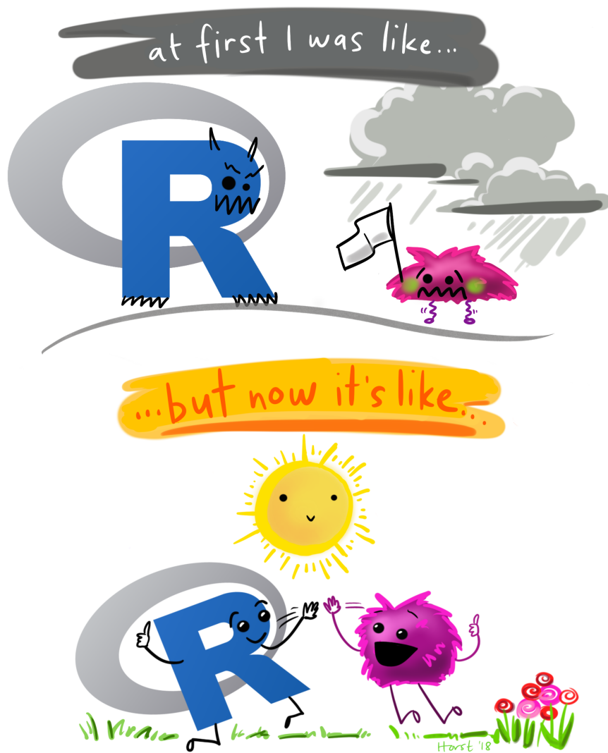
Figure 1: Artwork by @allison_horst https://allisonhorst.com/